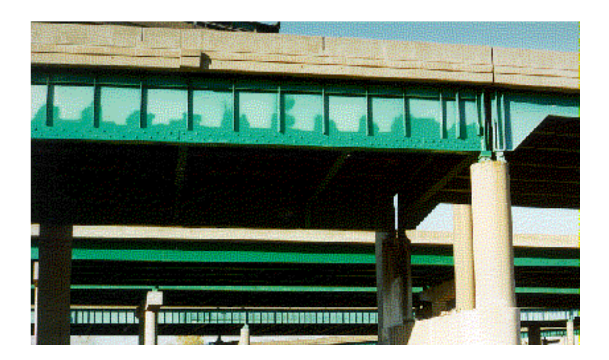
Figure 4. Photograph of the retrofitted I-55/I-64/U.S.-40 Poplar Street Bridge complex over the Mississippi River in St. Clare County, IL near St. Louis (NUCu Steel is painted in darker green)

In 2000-2001, 40 tons of one-inch-thick plates of NUCu 70W steel were used in the retrofit of the I-55/I-64/U.S.-40 Poplar Street Bridge complex over the Mississippi River in St. Clare County, IL near St. Louis. This bridge, located near the Madrid fault, had a cracked member. High strength steel was required because of weight limitations and high fracture toughness was required because of seismic considerations. The steel was cast and rolled by Oregon Steel Mills, Portland Oregon. We actively participated in this project. The steel composition and processing were discussed with IDOT and Oregon Steel Mills. We were involved with bridge fabricator during fabrication. For this application (seismic considerations) the NUCu 70W steel was normalized and aged after rolling. As measured by Oregon Steel Mills and Missouri Fabricators, the yield strength was 75 Ksi and the Charpy fracture energy at -10°F was 95 ft-lbs. The retrofit for this bridge was designed by Wiss, Janney, Elstner & Associates, fabricated by Missouri Fabricators and installed by St Louis Bridge Co. Figure 4 is a photograph of this bridge with the attached steel plates.