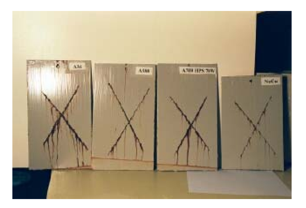
Figure 2. Painted Steel Panels after 3 Weeks, 35°C Exposure in Salt-Fog Chamber (A36; A588; ASTM HPS70W; NUCu (ASTM A710 Grade B) steels)