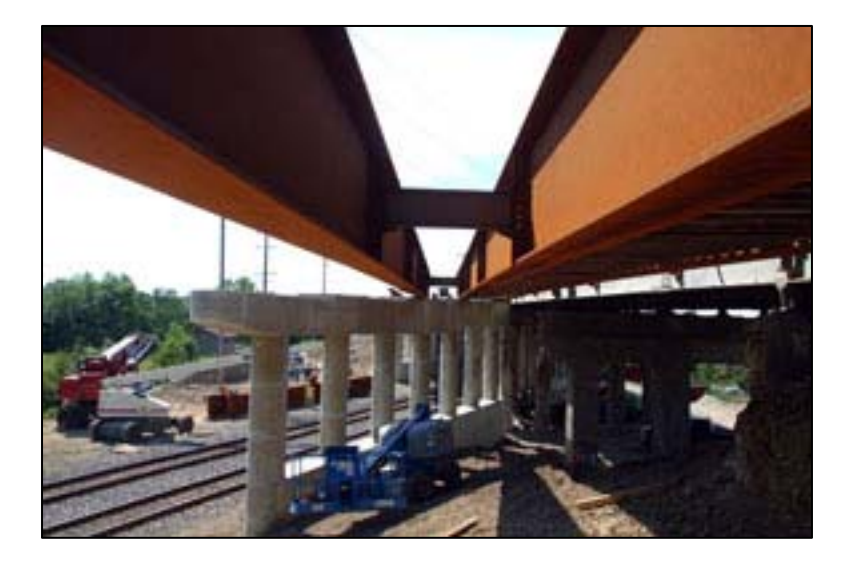
Figure 4. Photographs taken during fastening of the steel girders to the concrete supports of the bridge