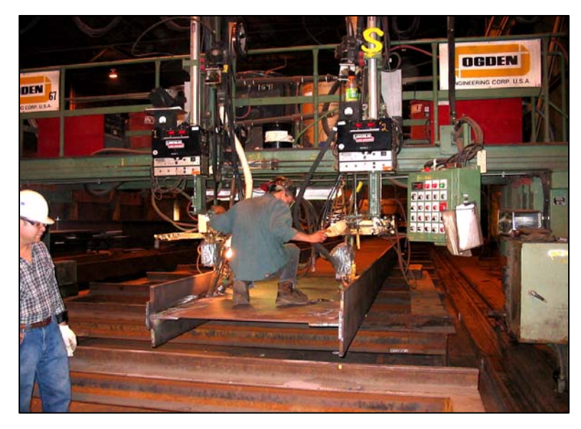
Figure 2. Welding of girders for the Lake Villa bridge at Industrial Steel Construction,