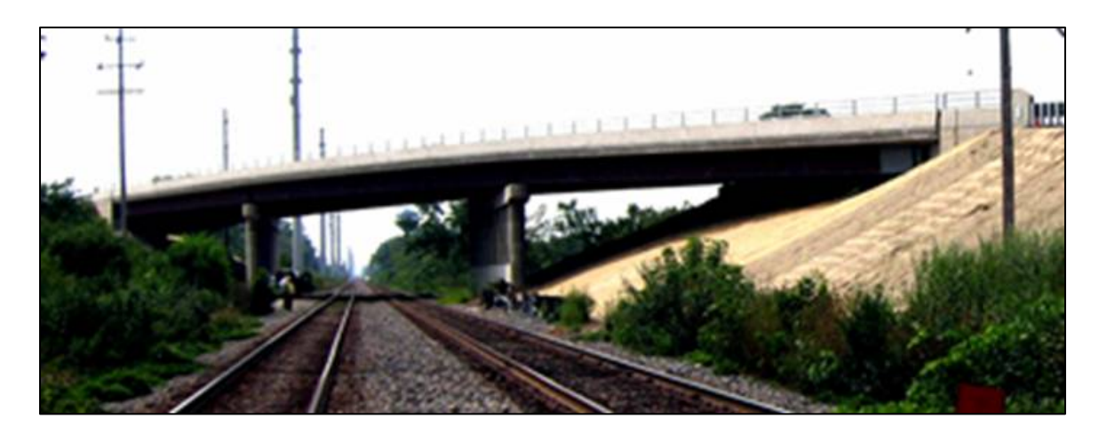
Figure 5. The finished bridge in Lake Villa, Illinois