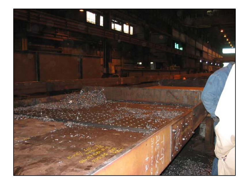
Figure 3. Holes are drilled in girders

The bridge was assembled at Lake Villa, Illinois by Dunnet Bay Construction. Since the steel possesses exceptional weathering characteristics, the bridge was not painted, resulting in significant savings in construction (appr. $300,000) and future maintenance cost. Use of unpainted steel resulted in additional savings due to easy handling during shipping and assembly; painted girders are easily scratched during construction and requires labor-intensive paint touchup after assembly.