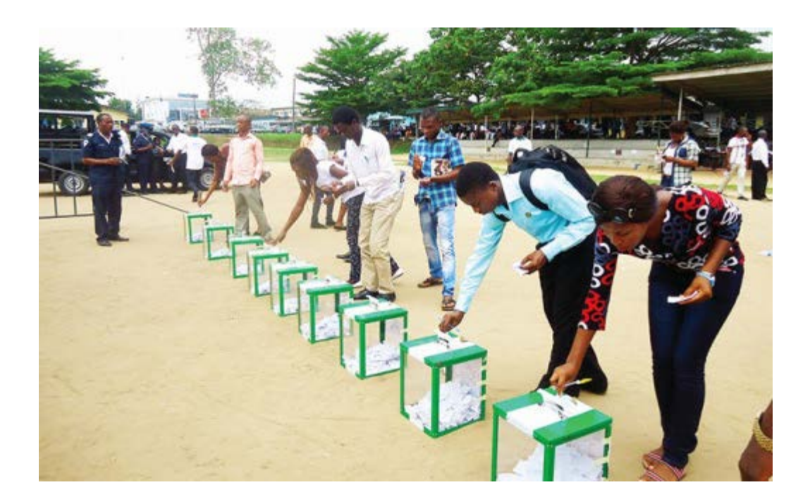
Nigerians voting in the historic 2015 general election.

Between June 2010 and July 2015, I had the rare privilege and opportunity of contributing to the building of a resilient electoral system in Nigeria that can address the overriding concern of conducting elections with integrity.